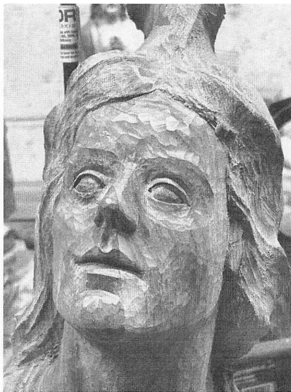
Fig. 2. Close up of St. John