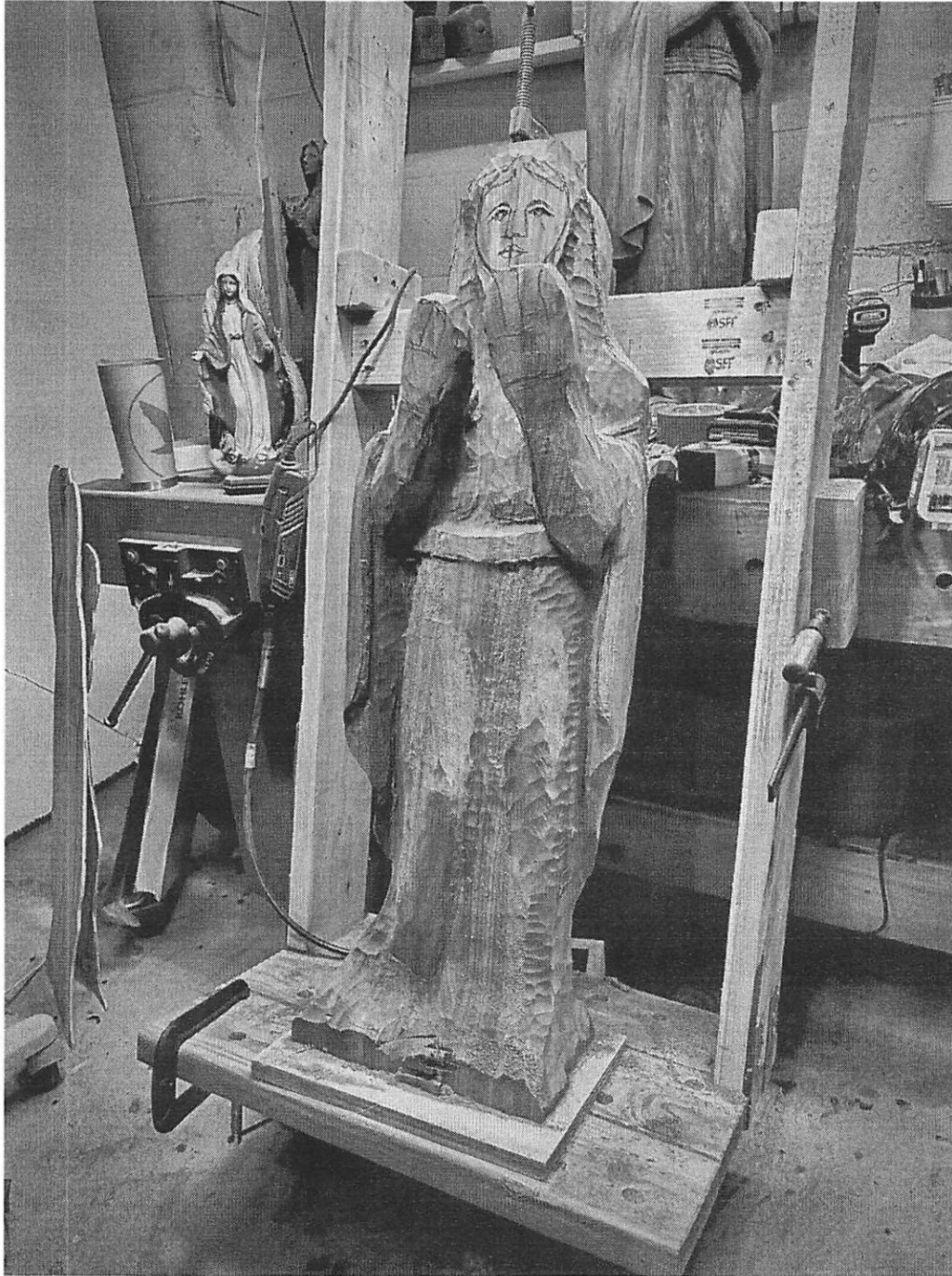
Fig. 3. Virgin Mary (rough in)